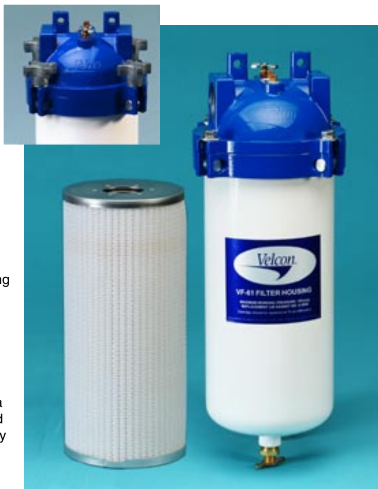
VF-61 shown with standard accessories and (inset) with optional quick release hand bolts.